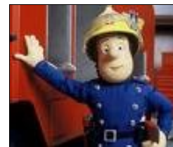
Ben & Holly 27 Aug * Peppa Pig 29 Aug,* Sam 28 Aug

Help Ben and Holly find any of these characters in the Meadow, Giant Elf Trees, Hedgerow or Wood – Ladybirds, Beetles, Butterflies, Green Shield Bug, Leopard Slug or Tree Bumblebee. (We'll provide spotter sheets) or design some Little Theme Rides. Bob the Builder is here on Sat 10 Sept to help with Park heritage and nature conservation jobs