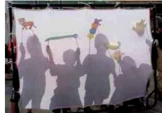
Natural adventurous places